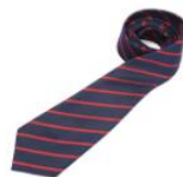
Hale School Tie