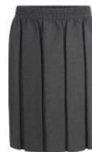
Grey Box Pleat Skirt