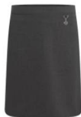
Grey Lycra Skirt with Heart Detail