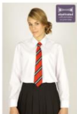
Pack of 2 Long Sleeve Polycotton Easycare White Blouses by Trutex