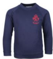
Hale Round Neck Sweatshirt by Trutex