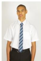
Pack of 2 Short Sleeve Polycotton Easycare White Shirts by Trutex