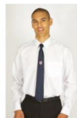
Pack of 2 Long Sleeve Polycotton Easycare White Shirts by Trutex