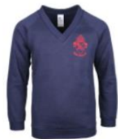
Hale V Neck Sweatshirt by Trutex