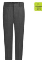
Boys Grey School Trousers with Waist Adjuster by Zeco