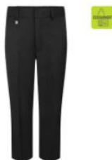
Boys Elastic Back Pull Up Grey School Trousers by Zeco