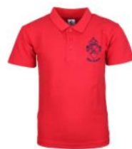
Hale Polo Shirt by Trutex