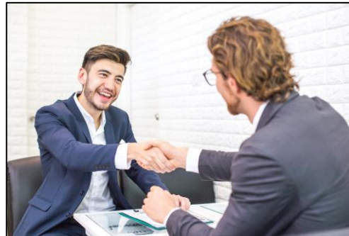
Face to face interview